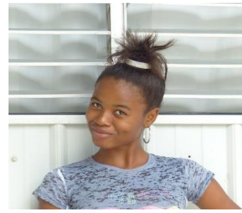
Thaichna - 9 th grade $500 home, $420 tuition

Paypal will add 1% to all donations using this link until Dec. 31 st